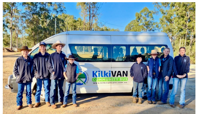
Great to have students from Kilkivan School's Cattle Club travel to Gympie Saleyards recently. Drivers always find KSS students a pleasure to transport.